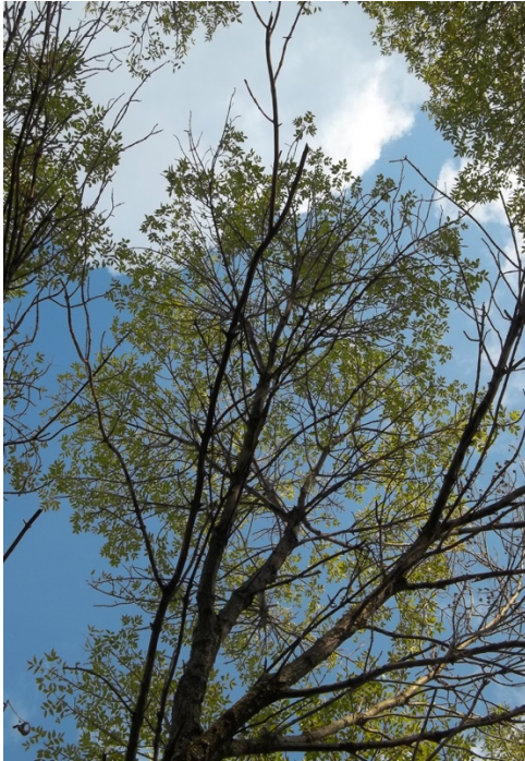
Moving Forward – Looking Ahead

The 2017 conference theme will explore ways to build resilience: